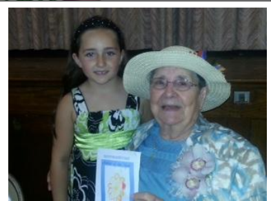
2015 Mother of the Year Receives Gift from Sunday School