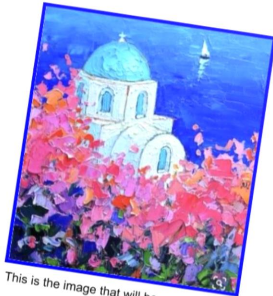
This is the image that will be used for painting.

Saturday Feb 1st 4:30 PM Church Hall $40