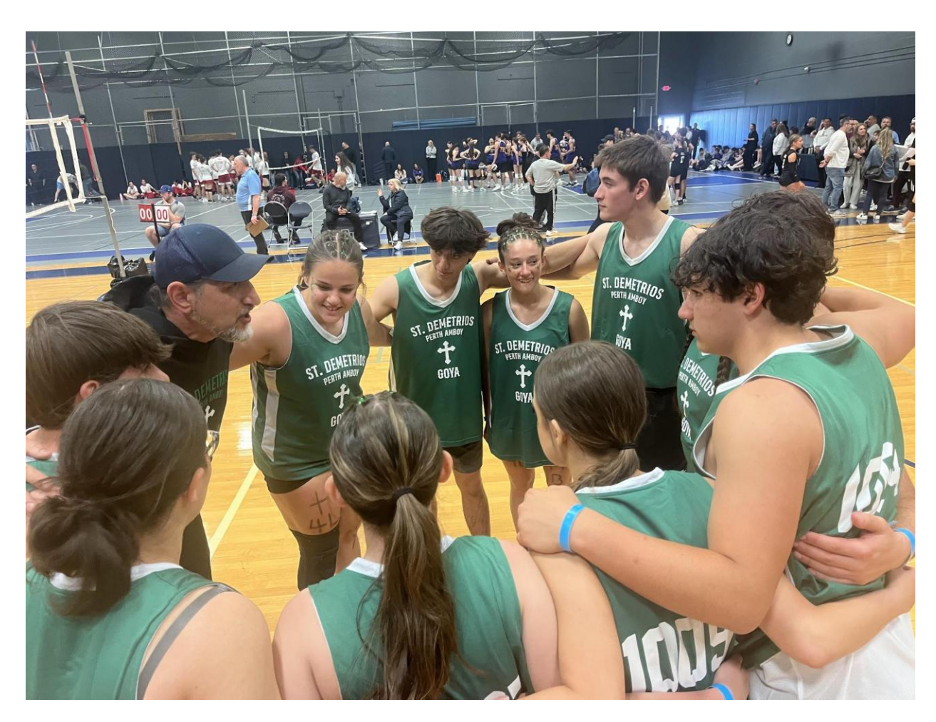
Getting ready to play volleyball