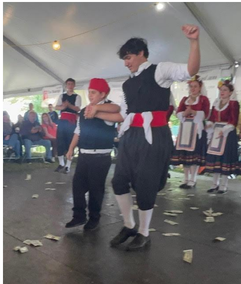
St. Demetrios GOYA Dancers