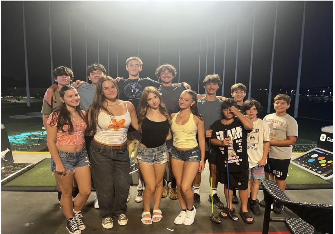
Playing golf at Top Golf with some of our new friends and finding new talents.