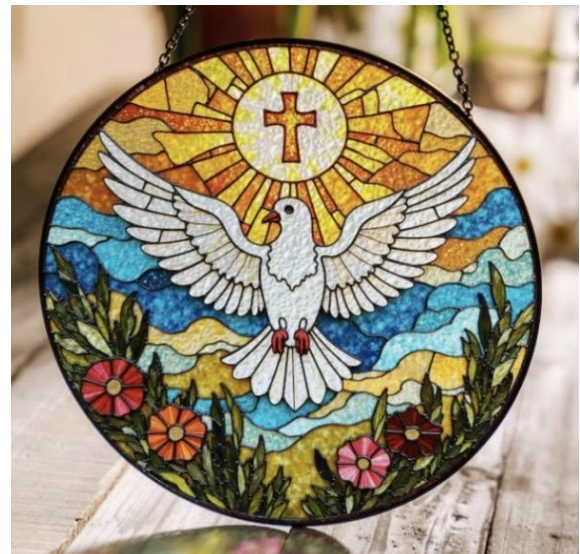
SUNDAY SCHOOL GIFT TO HIS EMINENCE.