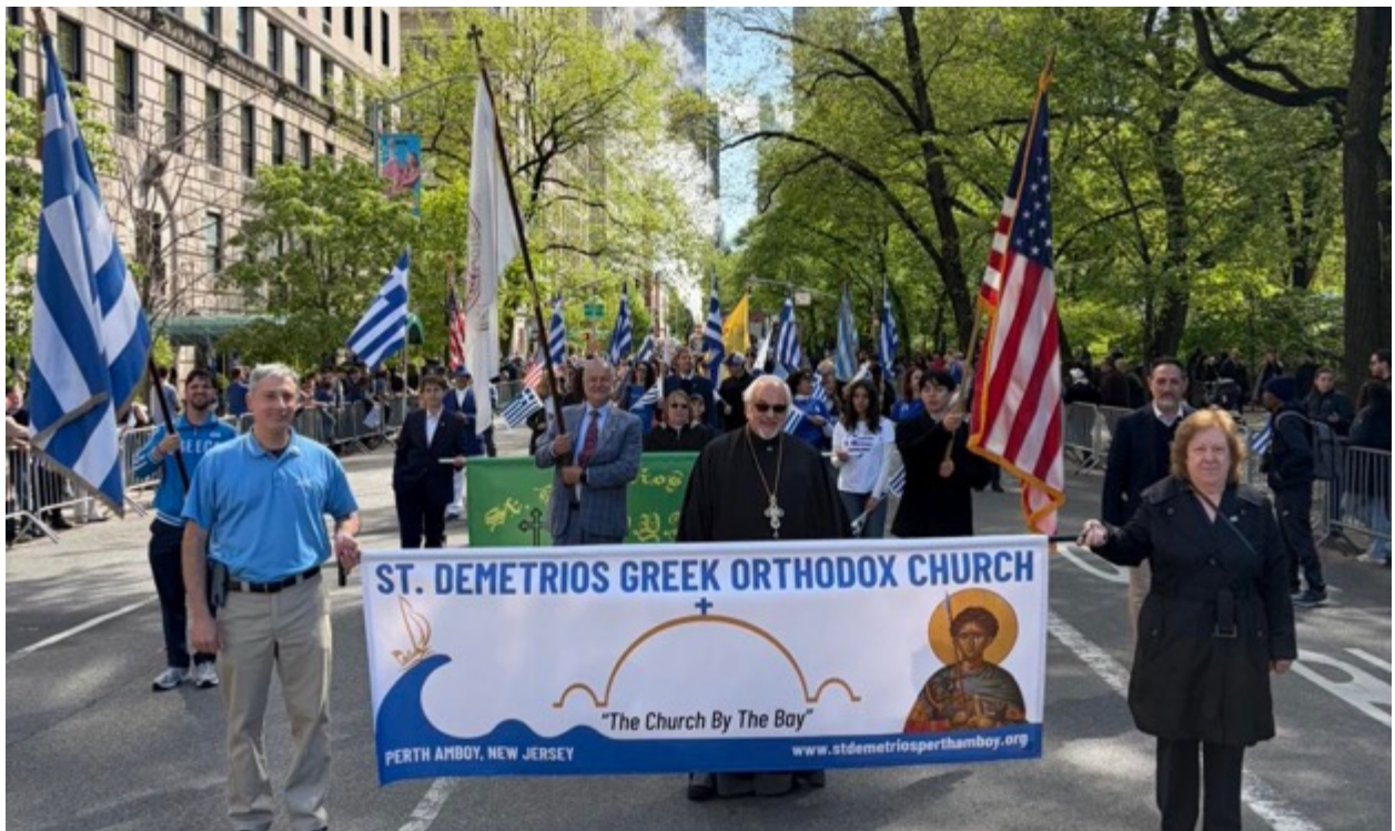
April 26, 2026, NY Greek Independence Day Parade, Fifth Avenue, New York