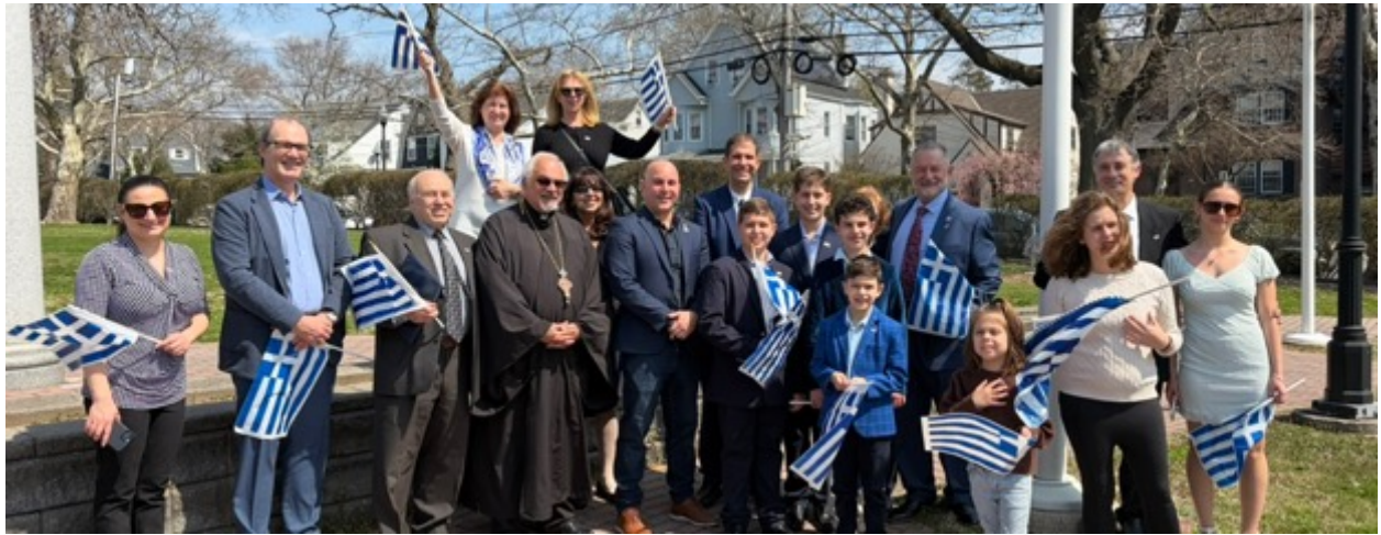
April 4, 2026, Greek Flag Raising Ceremony, International Park, Perth Amboy, NJ

Thank you to all who joined St. Demetrios in celebrating Greek Independence – 205 years of Hellenic freedom and heritage, and for taking part in the cherished traditions of our community in Perth Amboy and New York.